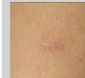
6 months - Control