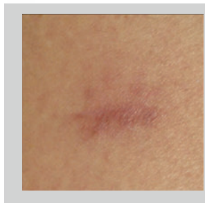
3 months - Control