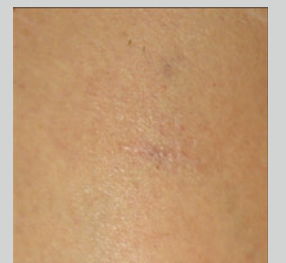
6 months with SUPER SERUM™ ADVANCE+ applied twice daily for the first 3 months and once daily for the following 3 months