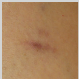
3 months with SUPER SERUM™ ADVANCE+ applied twice daily